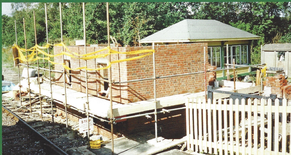
Left: The brick base under construction in July 1996. MICK BLACKBURN