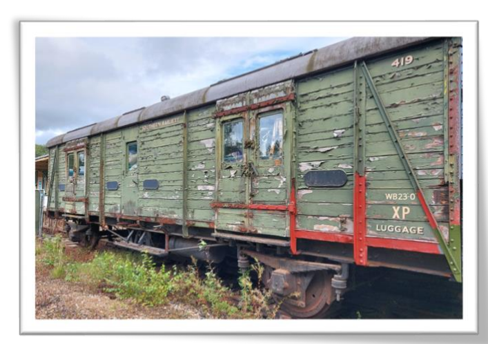
Two views of No. 419. Van C (BY) No. 419 showing (left) the good work that has already been completed on the platform side and (right) the side in need of the more attention.