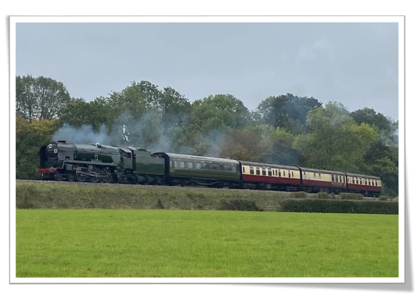
"Sir Archibald Sinclair" approaches Horsted Keynes on a loaded test run, 11 October.