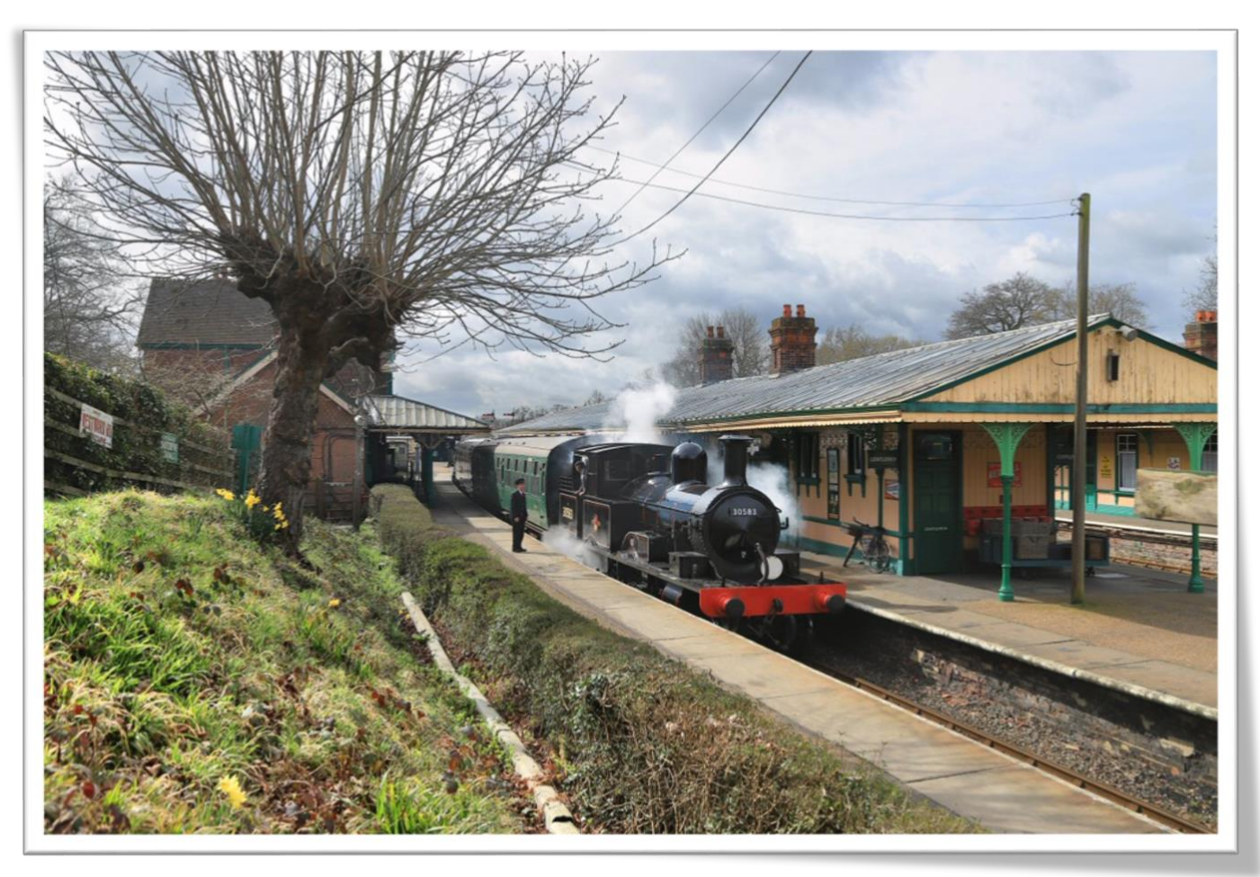
Hopefully a scene that can be repeated in a few years: 488 at Horsted Keynes on a Jon Bowers charter, 18 March 2019 – with hidden steam supply off stage!

It will be marvellous to see these three vintage locomotives, on average already more than 125 years old, in steam again. They are popular with the public and favourites of many of our supporters. They look fantastic with our historic carriages of the same era and are economical to operate.