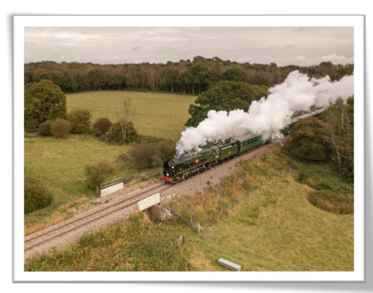
'Clan Line' leaves Sheffield Park during Giants of Steam.

In early 2022, limited tickets will be available on our website as we implement our new Electronic Point of Sale (EPOS) system during January. Running all our ticketing and sales across the Railway locations and website through one powerful system will give us great data to use to market events in the future and make commercial decisions based on up-to-date information. In February the website should be fully populated with the available tickets for upcoming events and services using the new EPOS system. Don't worry, the new system will not affect the great heritage experience visitors enjoy when using our booking offices on the day.