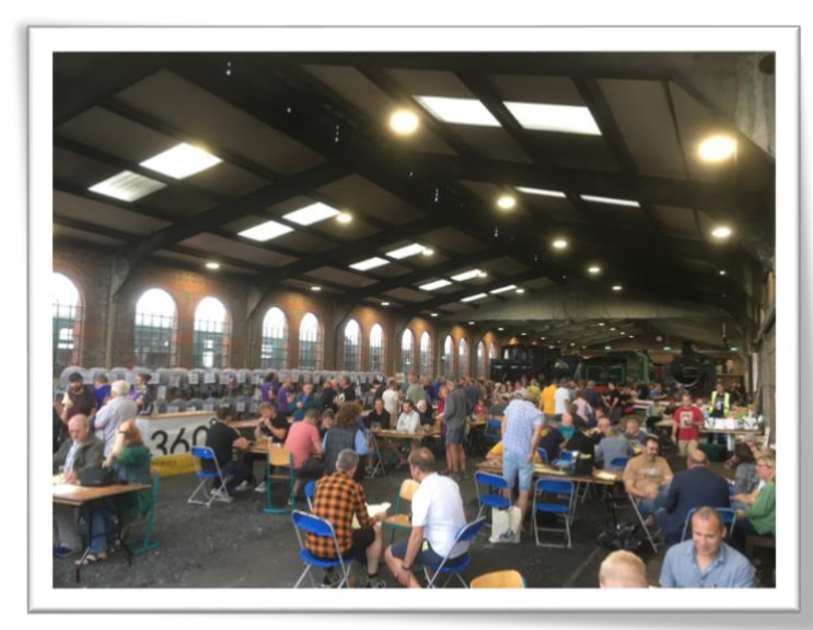
Last year's beer festival takes over the running shed

We kicked off the year with Road Meets Rail in July. It was our first event of the year and was hugely popular. Showcasing working traction engines at Horsted Keynes station, the outdoor setting and incredible weather encouraged families and enthusiasts to visit. This was followed by a later than normal Model Railway Weekend at the end of that month, which again was extremely well attended by not only visitors, but exhibitors with their amazing layouts. It was clear that people wanted to visit attractions again and the open-air setting for Road Meets Rail and the large,