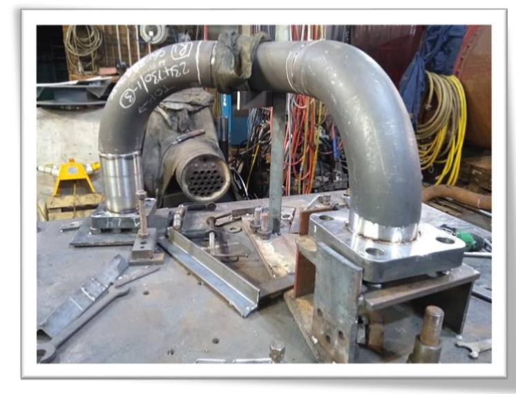
Top to bottom: Progress on Fenchurchh's boiler – new front ring and smokebox tubeplate. Boring the cylinders for No. 541 New steam pipes for No. 541