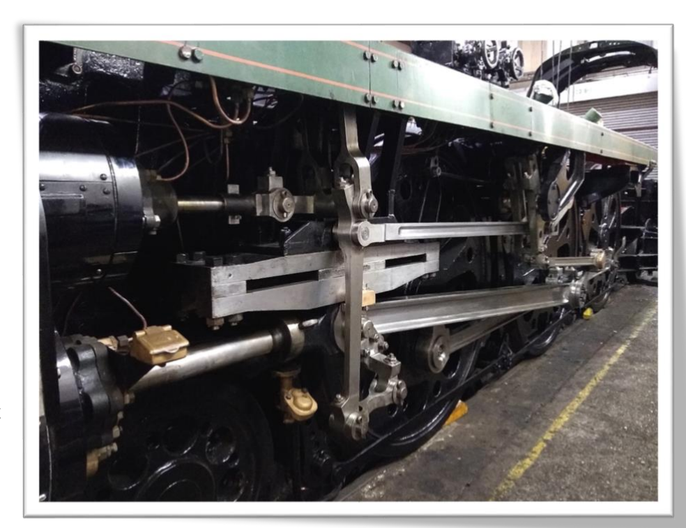
Top: Injector pipework and newly-painted nameplate and plaque holder for No. 34059 'Sir Archibald Sinclair'

Bottom: Reassembled motion and connecting rod and coupling rods on the left-hand side of 'Sir Archibald Sinclair'