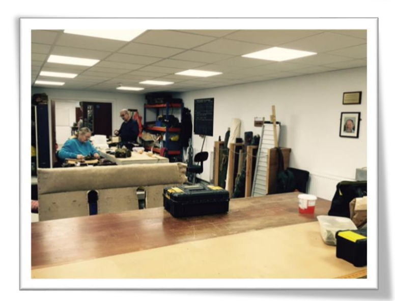
Two views inside the trimming shop.