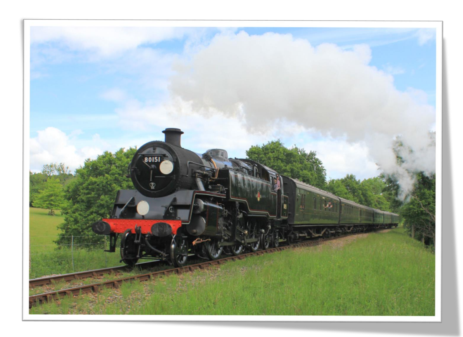
Events past: No. 80151 approaching New Coombe bridge with the 10.15am train from East Grinstead during the Road Meets Rail Event on Sunday 29 May.