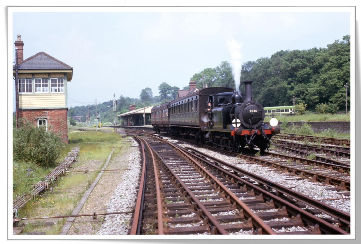
[105283] - Fenchurch leaving Horsted Keynes on 23 May 1964 shortly after arrival at the Bluebell Railway. In virtually the same condition as it left British Railways except the leading number 3 on the smoke box number plate has been painted over as has the emblem on the tank sides.