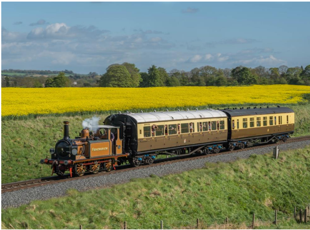
Undoubted star of the show at the recent Severn Valley Gala: Fenchurch