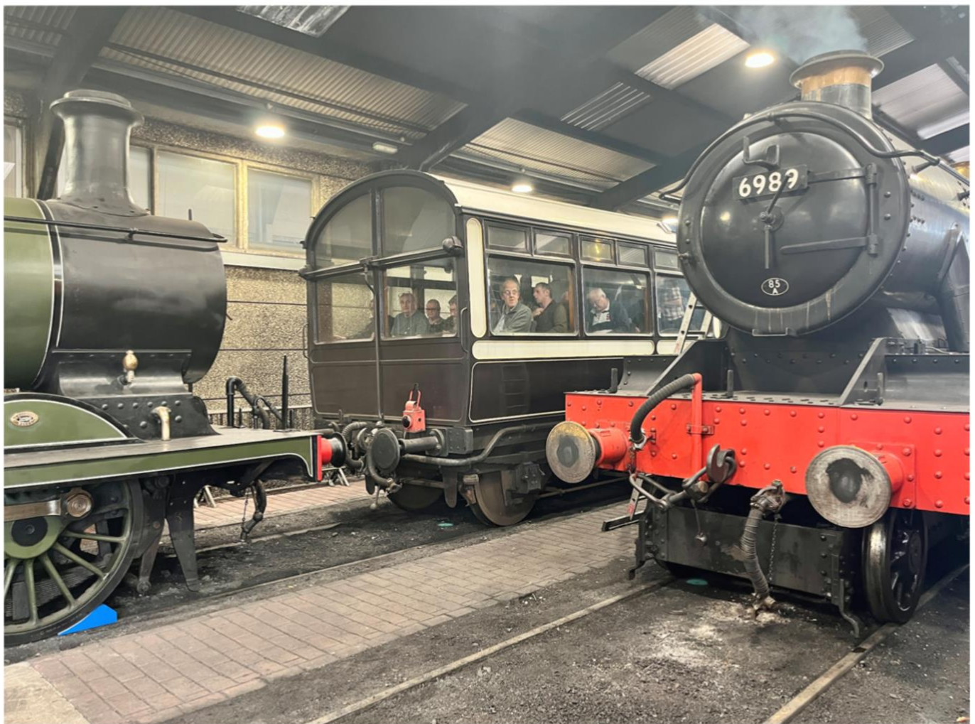
The Branch Line Society's Bluebell charter on Saturday 6 April involved all possible running lines and sidings using the LNWR Observation Car, hence the very unusual sight of a carriage load of passengers in the Sheffield Park running shed!

Starting from Sheffield Park at 9:15am we went to East Grinstead, Kingscote, Horsted Keynes, Sheffield Park, Horsted Keynes, Kingscote and East Grinstead before finishing 15 minutes early back at Sheffield Park at 5:55pm.