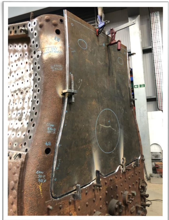
Top: New boiler plate awaiting welding into place on 541's firebox outer wrapper.