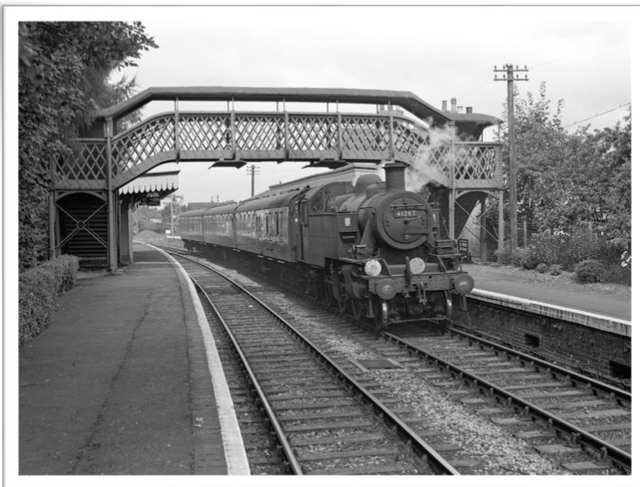
Left: Ivatt 2MT 2-6-2T No. 41287 at Cranleigh station with the 10.34am from Guildford to Horsham on 1 August 1964.