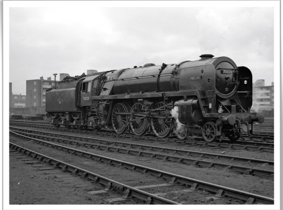
Above: BR Standard class 7 No. 70020 'Mercury' at Nine Elms Shed on 7 March 1964.