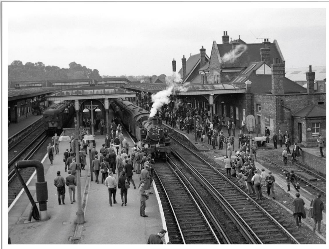
Left: Ivatt 2MT 2-6-2T No. 41287 at Guildford with the 7.34pm to Horsham on the last day of service on this route, 12 June 1965. The loco has various farewell messages on it, written in chalk and there are large crowds on the platforms and trackside.

The most important thing is to let others know your wishes and leave written instruction, especially if you are not around to make sure your wishes are followed. Too many collections have been lost or split up because an instruction wasn't left in a Will. This is the best way ensure a collection you have is to survive and the work live on.