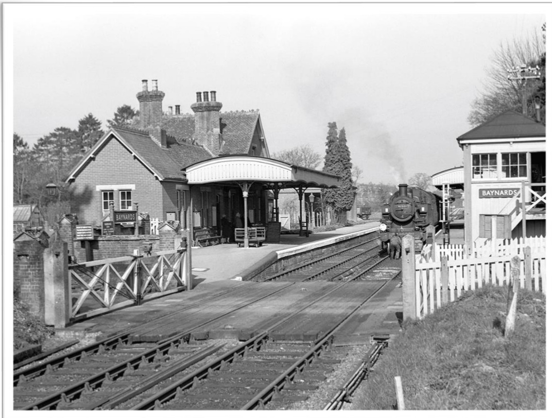
Left: Ivatt 2MT 2-6-2T No. 41301 at Baynards station with the 9.22am from Guildford to Horsham on 13 April 1962. John Scrace

To view and order go to www.brm-archive.co.uk . There are various searching methods, including by locomotive number or class and location. The content key search allows you to see all the images of a particular type, for example, all the images taken of Pullmans. Use the New key to see all the latest images including those mentioned and shown here and the Nearly New key to see what we added last month.